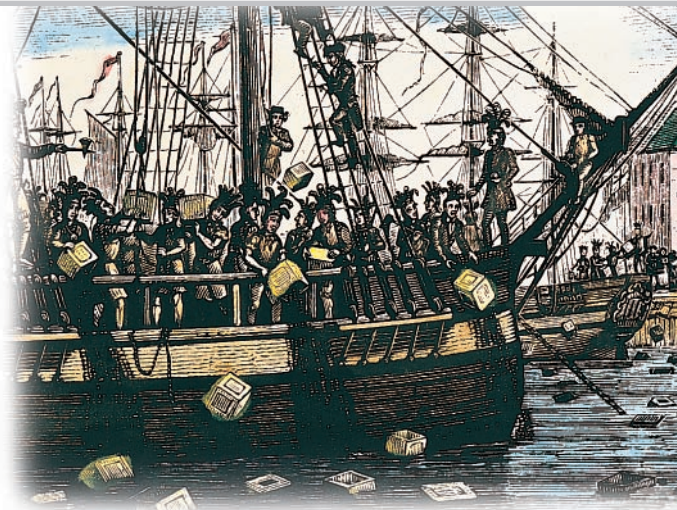
Colonists dumped hundreds of chests of tea into Boston Harbor in 1773 to protest the Tea Act.