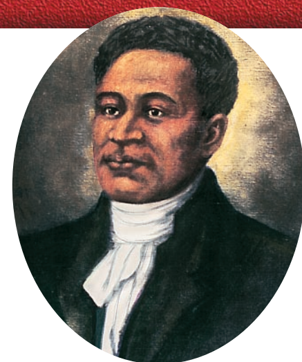
Crispus Attucks, a sailor of African-American and Native American ancestry, was an early hero of America's struggle for freedom.

In March 1770, Attucks found himself in Boston, where feelings against British rule were reaching a fever pitch. The words freedom and liberty seemed to be on everyone's lips. One night Attucks heard about a disturbance involving colonists and British troops and decided to investigate. He had no idea that he was about to play a key role in American history—losing his life to a British bullet in a protest that came to be known as the Boston Massacre. In this section, you will read how the tension between Britain and its colonies led to violence.