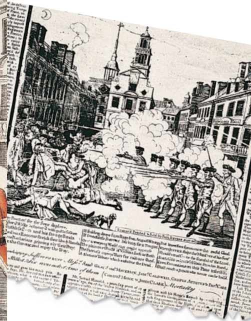
This engraving, The Bloody Massacre Perpetrated in King Street by Boston silversmith Paul Revere, appeared in the Boston Gazette .

“no mobs. . . . Constitutional methods are best.” However, tempers were running high. When customs officers in Boston tried to seize the American merchant ship Liberty , which was carrying smuggled wine, a riot broke out. The rioters forced the customs officers to flee.